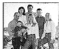
"I'M FORTUNATE TO HAVE A CAREER THAT PROVIDES ME SO MUCH TIME FOR MY FAMILY."